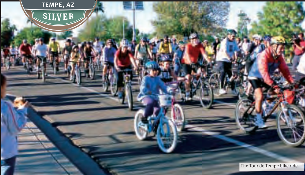
The Tour de Tempe bike ride