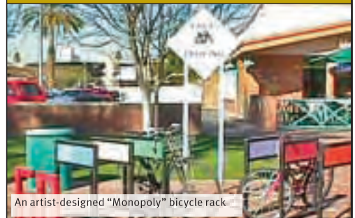
An artist-designed "Monopoly" bicycle rack