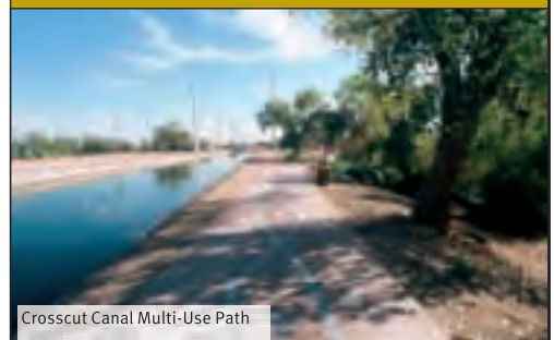
Crosscut Canal Multi-Use Path