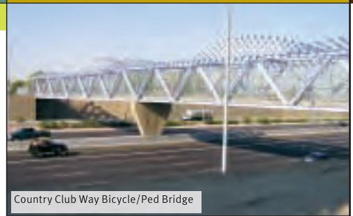
Country Club Way Bicycle/Ped Bridge

Tempe continually implements innovative and progressive facilities with a strong financial commitment of more than $5 million in bicycle projects in the annual budget.